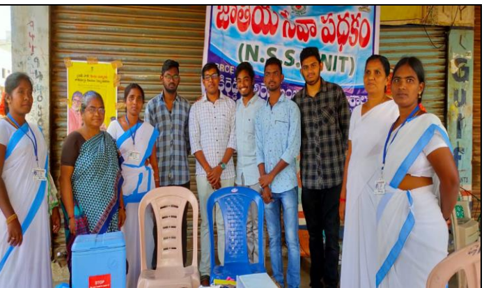
NSS Volunteers helping to the Health Department Staff and Anganvadi Workers during Polio Immunization