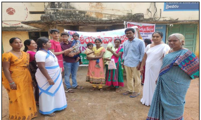
NSS Volunteers helping to the Health Department Staff and Anganvadi Workers during Polio Immunization